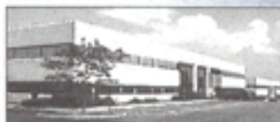
INDIANAPOLIS OFFICE • 317/844-0919