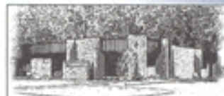
MARION OFFICE • 765/664-9637