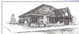
HARTFORD CITY OFFICE • 765/348-2020

WILL BE PRESENTING TWO PROGRAMS AT THE NATIONAL LOW VISION CONFERENCE IN LAS VEGAS IN APRIL. HE WILL ADDRESS NEW TECHNOLOGY AND LOW VISION CARE OF VISUAL FIELD LOSS.