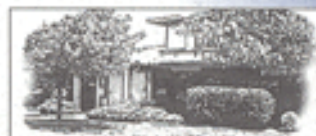
FORT WAYNE OFFICE • 219/432-0575