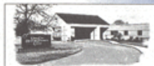
UNION CITY OFFICE • 765/964-5657